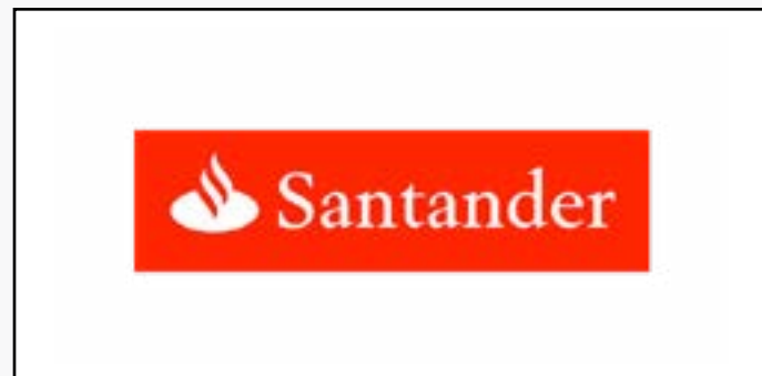
Head of Operational Risk Santander