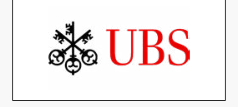
Chief Information Officer UBS