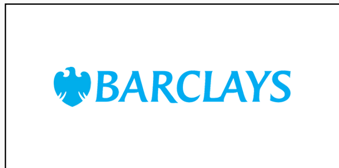
Director of Operational Risk Barclays